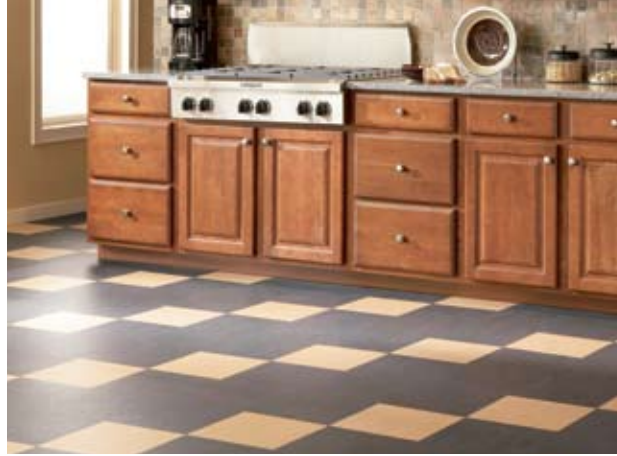
763876 camel, 753872 volcanic ash