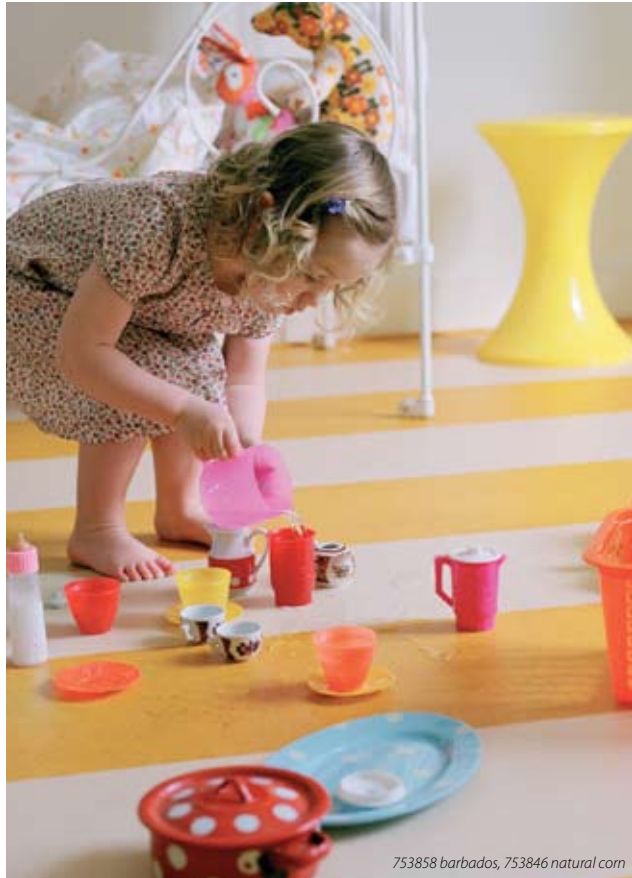
753858 barbados, 753846 natural.com