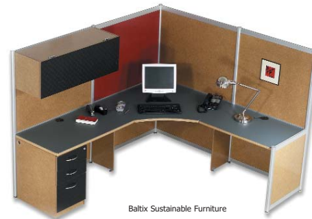
Baltix Sustainable Furniture