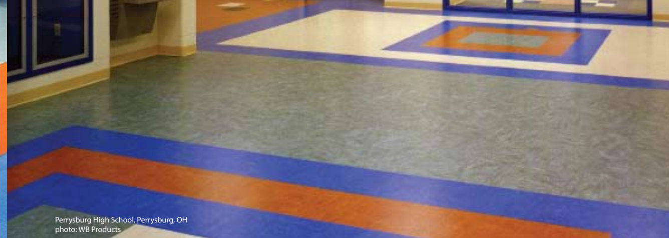
Perrysburg High School, Perrysburg, OH