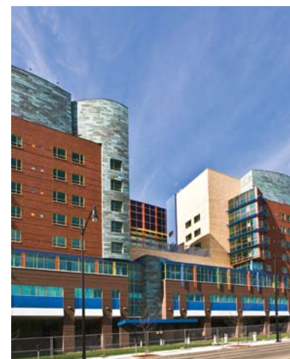
Children’s Hospital of Pittsburgh, UPMC, Pittsburgh, PA

The process to incorporate sustainable thinking in any project is really not that difficult. The difficulty is accepting that the older conventional practices need to be reconsidered. Change is hard for humans. It is the process of changing that is actually the most exciting aspect of reaching towards sustainability. The technologies will always be improving in sometimes subtle and sometimes significant leaps. When we build in a sustainable manner it is the change of perspective, the change of heart, and a fundamental reawakening of an awareness of our relationships to the systems of life that makes all this worthwhile.