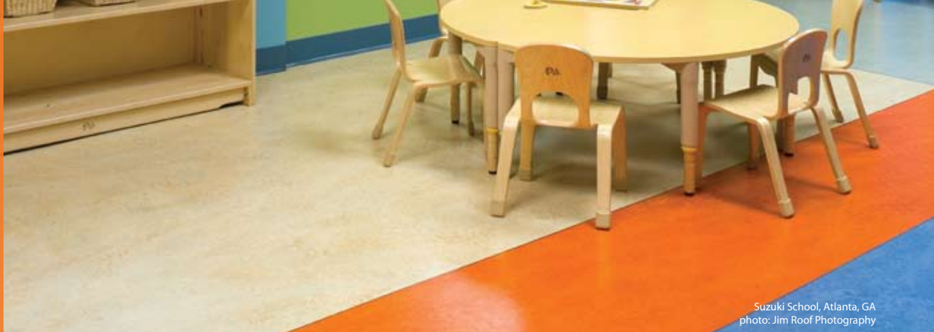
Suzuki School, Atlanta, GA