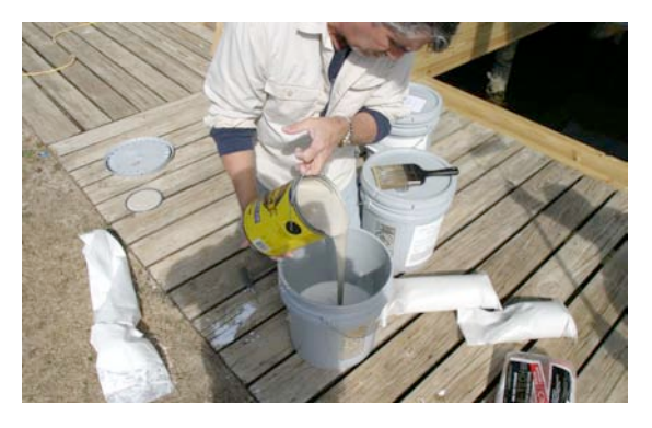
3. Blend the wet ingredients until thoroughly mixed.

2. Empty paint requirement into container. UDF-21 requires 1 gallon. Use only exterior latex or acrylic paint.