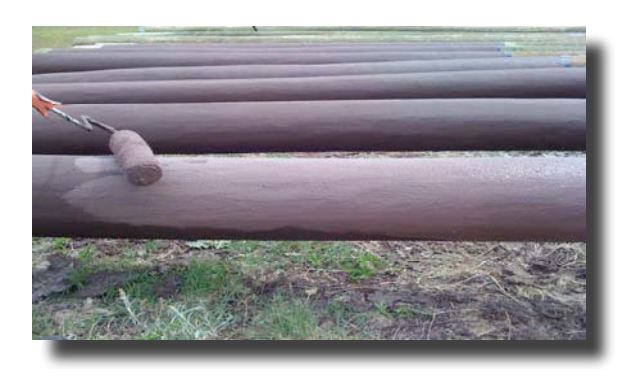
IMPORTANT Coated parts require a 48 hr. cure <u>process</u>.

6. Once base coat is dry to the touch, apply the topcoat. Be consistent with technique!