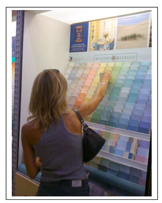
Your color palette is unlimited when you use UDF-21.

A pastel here. A wood tone there. The color options available for an outdoor deck are cliché at this point.