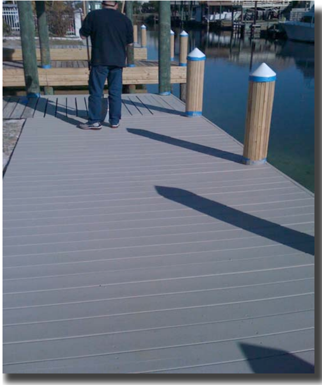
UDF-21 is applied to a wooden dock using a roller. One kit covers approximately 400 square feet (2 coats required).

All of a sudden, that expensive composite decked pier is ravaged by a storm and your investment has vanished.