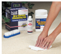
Blot up excess moisture.

If traces of the spot remain, follow procedures in E. Stubborn Spots.