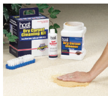
Pack area with a handful of HOST Dry Carpet Cleaner.