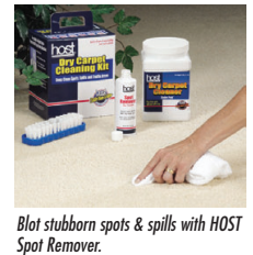
Blot stubborn spots & spills with HOST Spot Remover.

*HOST Spot Remover or other liquids (unless specified) are not recommended for use on natural fiber carpet and rugs.