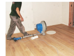
Use a 2nd pad to remove all excess oil and rub area very dry. (Figure 8) (Additional pads if necessary)

Oil which has not reacted needs to be rubbed off completely by no more than 15 minutes after application. This means ALL of the excess. The color can't be darkened by leaving excess oil on for longer. You can never rub off too much oil; however, you can rub off too little.