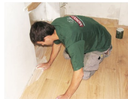
Apply the oil to the perimeter with cloth. (Figure 1)