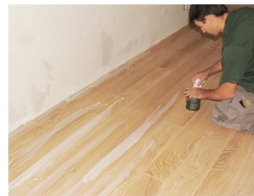
Apply stripes lengthwise with a cloth, squirt, or spray bottle to the center of the planks. (Figure 2)