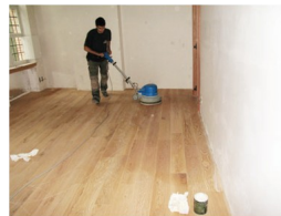
Spread the applied oil equally with a white pad. Red pad works well also. (Figure 3)