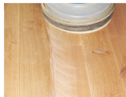
Move the surplus product to adjacent planks. (Figure 5)

Allow 3 minute minimum reaction time between the application of oil and removal of excess.