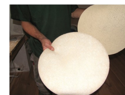
Figure 9 shows the two white pads that were used for

the application and removal. The same two pads can be used for the same purpose on the next area. (Figure 9)