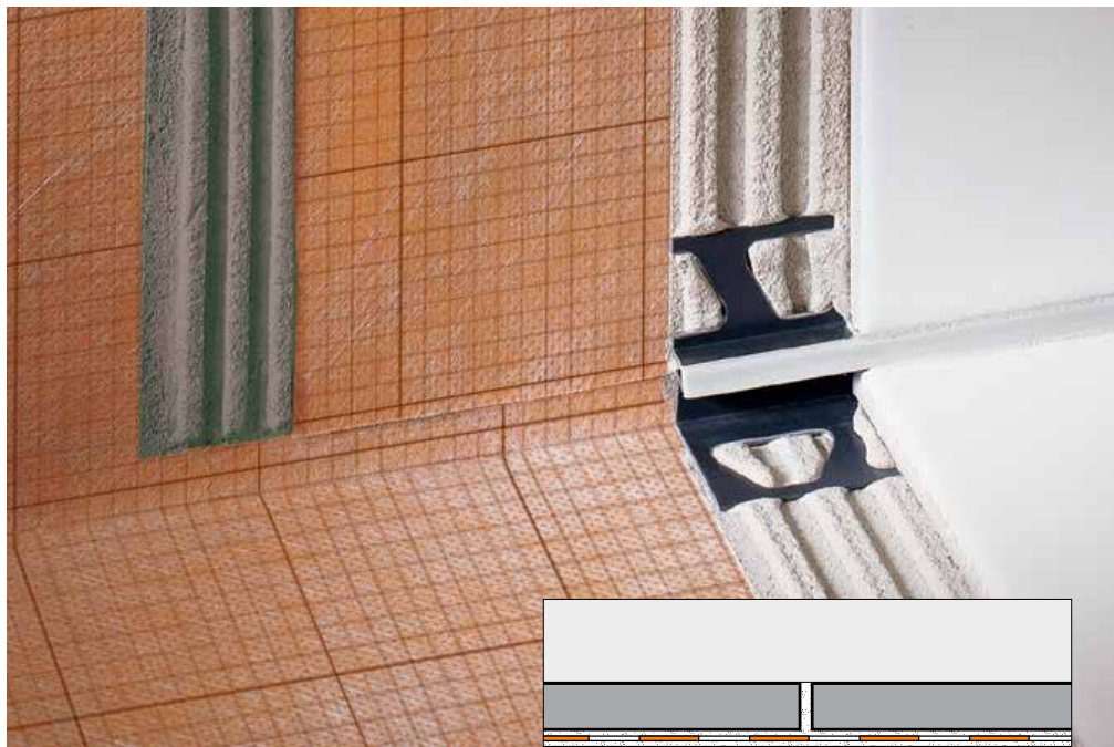
8.1 Schluter®-KERDI 8.1 Schluter®-KERDI-DS

Preformed, seamless corners include the following. KERDI-KERECK-F are used to seal 90° inside and outside corners. KERDI-