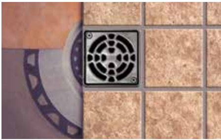
Schluter®-KERDI-DRAIN assembly with Schluter®-KERDI waterproofing membrane.

KERDI and KERDI-DS are waterproof and resistant to most chemicals commonly encountered in tiled environments. They are resistant to aging and will not rot. KERDI and KERDI-DS are highly resistant to saline solutions, acid and alkaline solutions, many organic solvents, alcohols, and oils. Information regarding their resistance to specific substances can be provided if concentration, temperature, and duration of exposure are known. For acid-resistant coverings, use an epoxy adhesive to set and grout the tile.