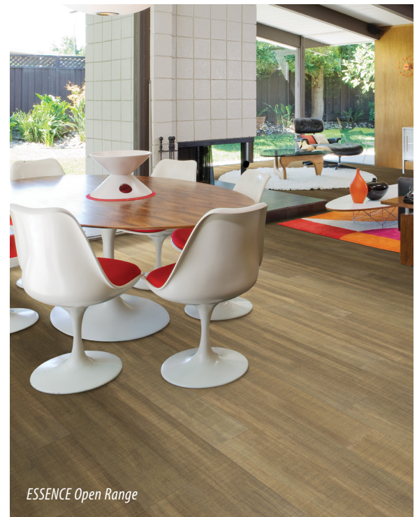
ESSENCE Open Range